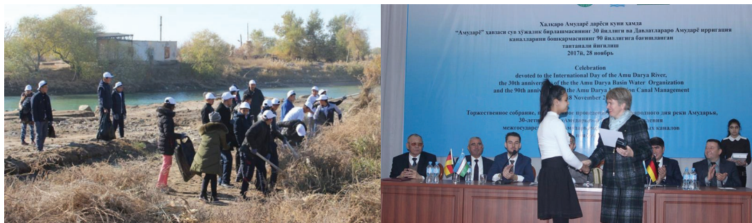
“The Amudarya River Day” (from left to right):

1) Cleaning of the Amudarya River bank - Uzbekistan